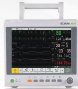
iM70 Patient Monitor